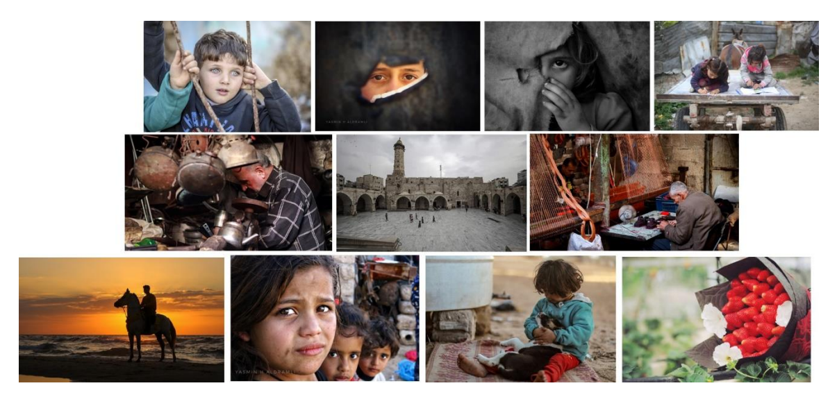
Some Photos from photography course students