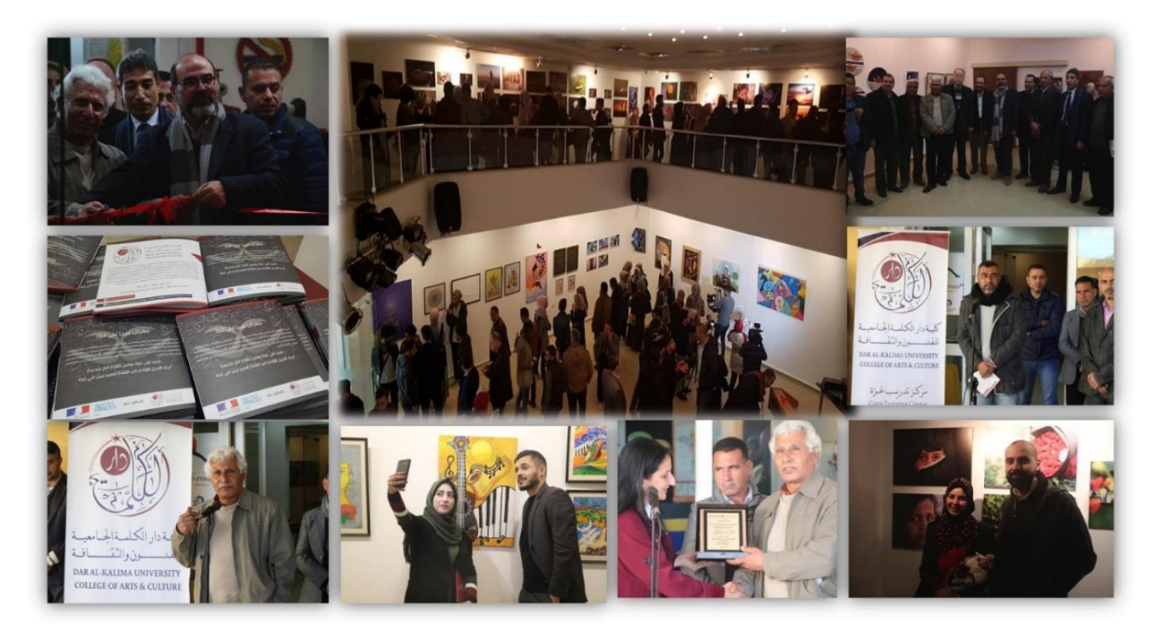
Eye on Gaza Exhibition Opening