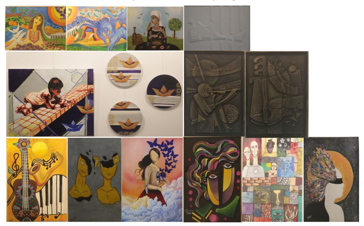
Some artwork by the Design course participants